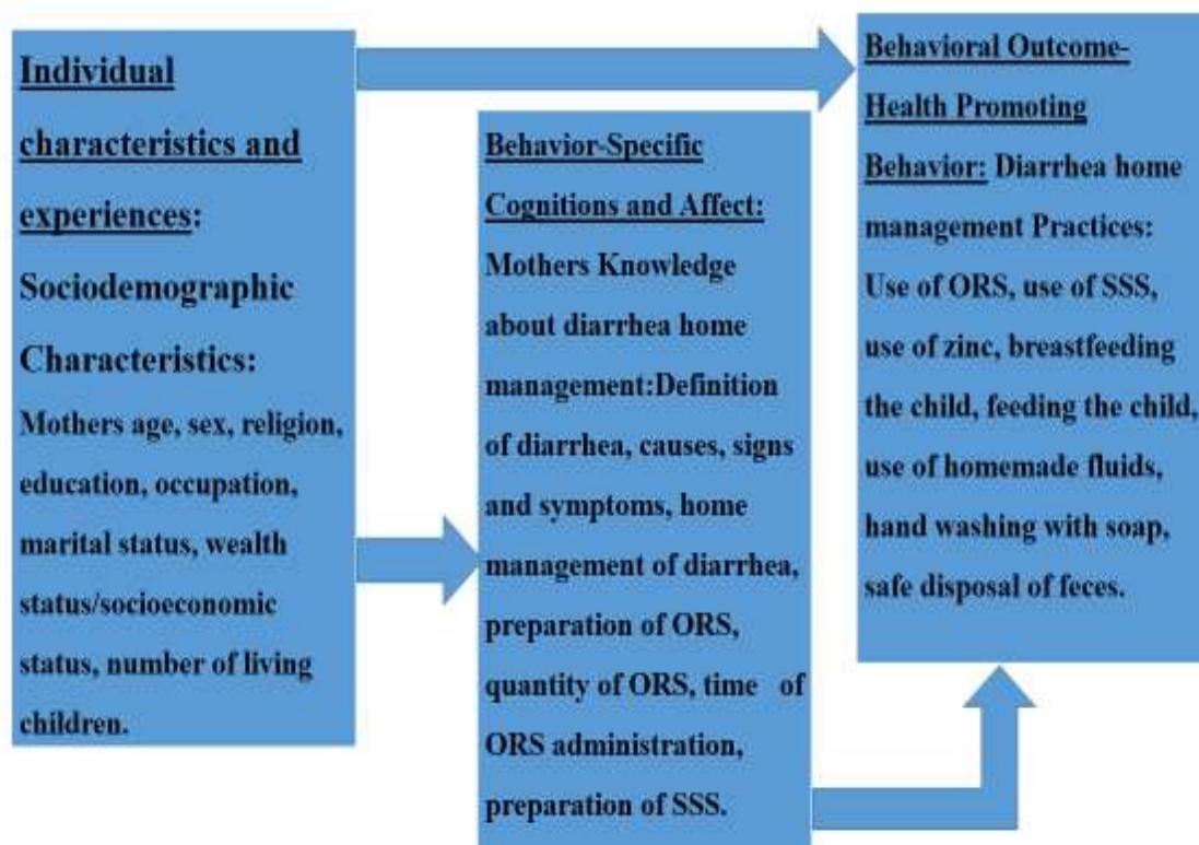
Figure 1. Conceptual framework adapted from Pender Health Promotion Model 2011: Interacting interlinked factors leading to diarrhea home management practices.