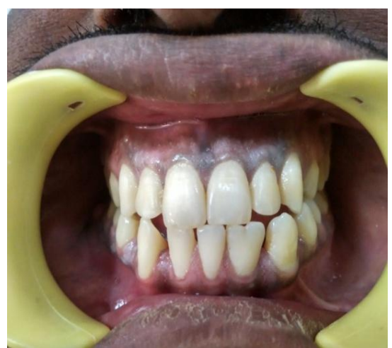
Fig 1: clinical image

noticed that only 3 incisors were present in the mandibular arch and 32 was found to be missing. It was also observed that left permanent mandibular central incisors were abnormally large in size with increased width mesio-distally. (Fig: 1) The patient's medical history was uneventful and was unaware of this dental irregularity and gave no history of any pain or discomfort associated with it. Thorough family history did not reveal any congenital dental anomalies and the accompanied parent had a normal permanent dentition. On the basis of the clinical findings, a preliminary diagnosis of fusion was made i.r.t 31 and 32.